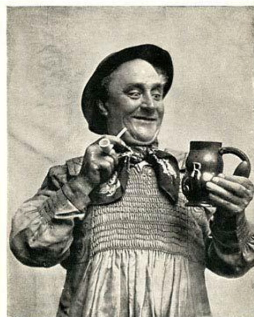
A Trowbridge reveller yesterday

For those who like to keep it tight there will be a run round the Christmas lights in Melksham on Wednesday 21 st December commencing at 19:00 at Christie Miller sports centre. Santa outfits, reindeer antlers and tinsel are essential running wear for this event; we will then converge on the Pilot at Bowerhill for some post run re-hydration and Christmas cracker pulling.