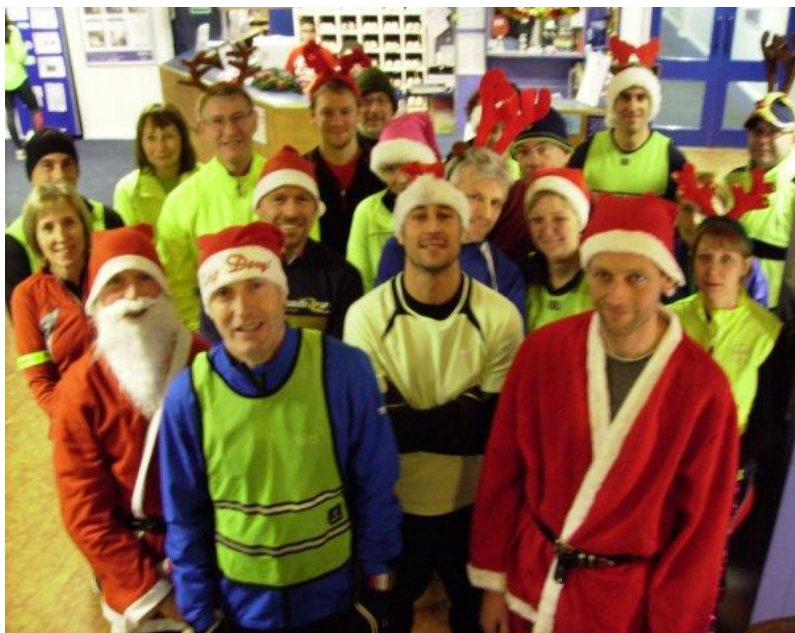
Melksham Christmas lights running team 2009, prior to the trip to the pub!